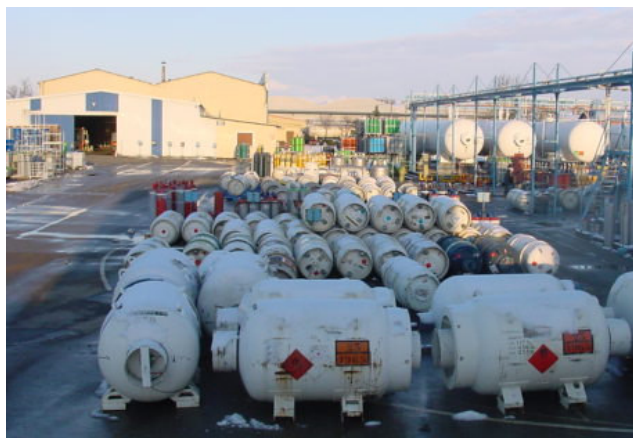
Inventec - Saint Priest

The impact of SF 6 on the greenhouse effect is very important. It has been included in the group of greenhouse gases listed in the Kyoto Protocol in December 1997. Thus, it is particularly important to control its use and to minimize releases to the atmosphere. Regeneration is possible and INVENTEC has developed an Ecoprogram avoiding its destruction in many cases.