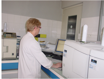
Photo: laboratory analysis of SF 6 .

We receive brand new SF 6 in bulk from various producers. Upon the arrival of gas in our factory, our laboratory analyses the gas in order to be sure that it complies to the IEC 60376 standard.