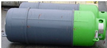
Drums 600 l

The vapour pressure of SF 6 is such that this gas must be put in cylinders with a test pressure of 70 bar minimum. INVENTEC offers a range of packaging from 7 to 600 l of which you will find the specifications below: